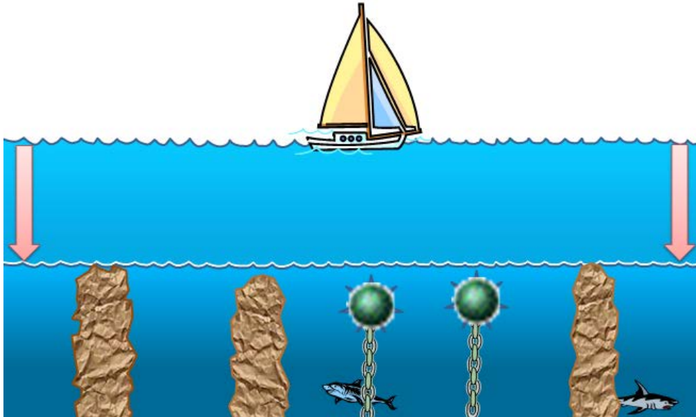
Figure 1. Sea of Obstacles.

all potential dangers are considered, and making sure that the new mitigations do not introduce new threats or remove previously implemented safety mitigations.