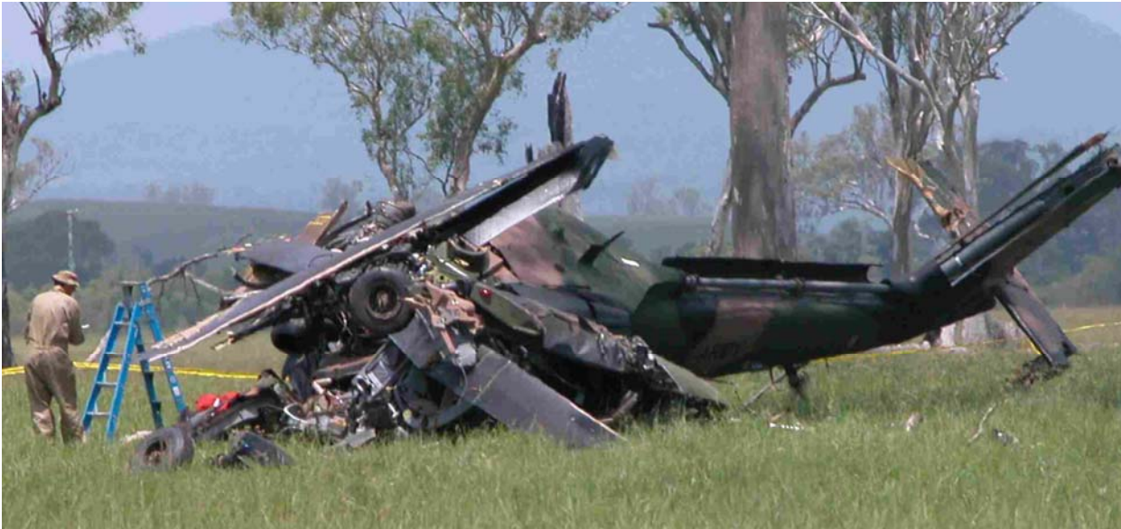
Figure 4. ADF Black Hawk 216 accident 12 Feb 04.