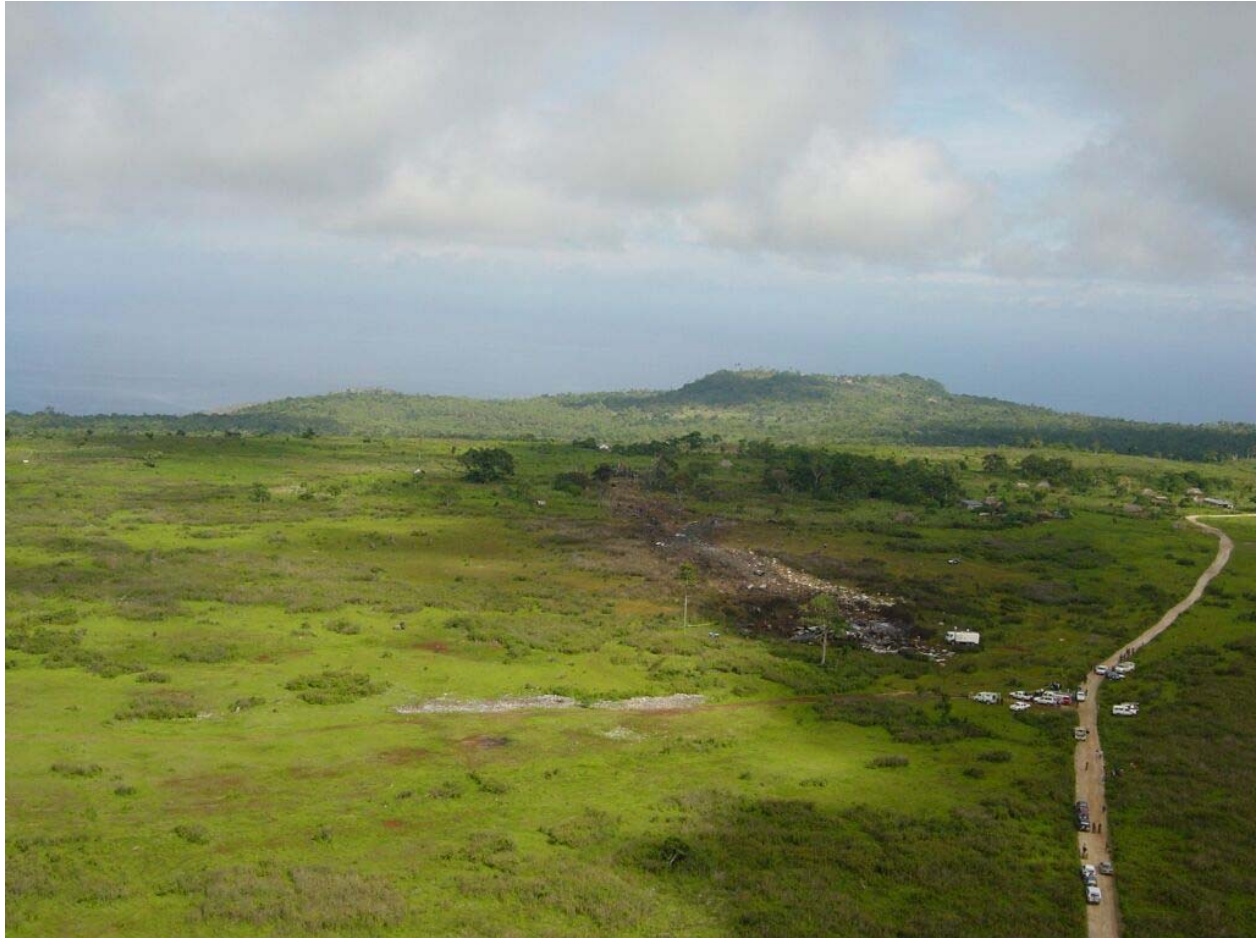
Figure 3. IL76 Accident East Timor 31 Jan 2003